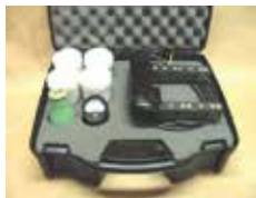
Deluxe Dry Method (W-DM)