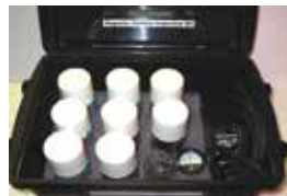
Wet Visible (W-WM)