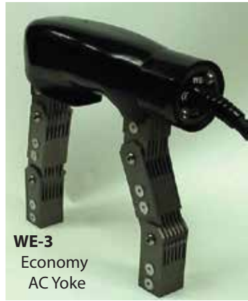
WE-3 Economy AC Yoke

Voltage: 115 and 230 VAC Nominal (12VDC) Models: WE-3HD (115 Volt) WE-3HDK (230 Volt) Current: 4.0 Amps (115V), 2 Amps (230V) Frequency: 50 or 60Hz