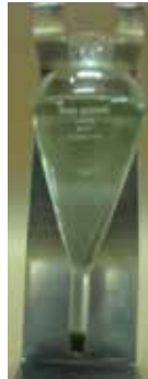
W-CT, Centrifuge Tubes and Stands