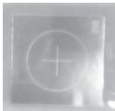
QQI's (all 5 types)