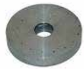
W-KT, Ketos Ring