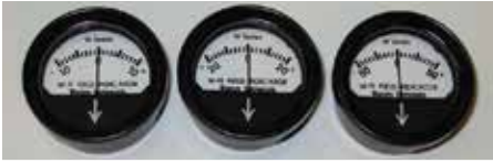
W-FI, Pocket Magnetometers W-FI-10, W-FI-20, W-FI-50

The W-Series Product Line offers numerous Magnetic Particle Operating Accessories, to evaluate magnetism, equipment performance, defect sensitivity, etc.