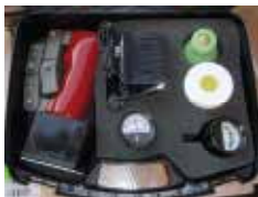
Basic Dry Method, (W-DMB)

Wetern Instruments offers 6 different MPI Kits, which are available in 4 different sizes of cases. Kits consists of; case, consumables, and accessories.