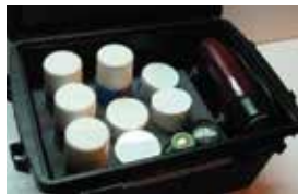
Wet/Dry Method (W-WD)