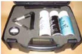
Basic Wet Method (W-WMB)