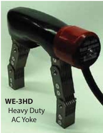
WE-3HD Heavy Duty AC Yoke

Voltage: 115 and 230 VAC Nominal (12VDC) Models: WE-3HD (115 Volt) WE-3HDK (230 Volt) Current: 4.0 Amps (115V), 2 Amps (230V) Frequency: 50 or 60Hz