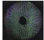
MTU No. 3, ISO 9934-2 Type 1