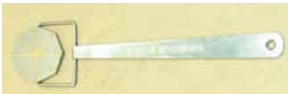
W-PG, Pie Gauges