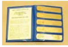
Castrol Strips (Type I & II)