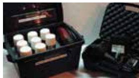
Wet Fluorescent (W-WF)